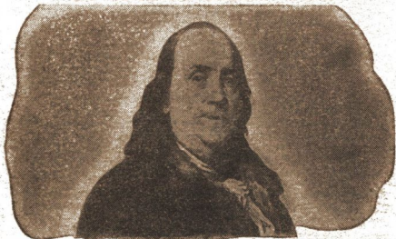
BENJAMIN FRANKLIN < A Rosicrucian >

W HY was this man great? How does anyone—man or woman—achieve greatness? Is it not by mastery of the powers within ourselves?